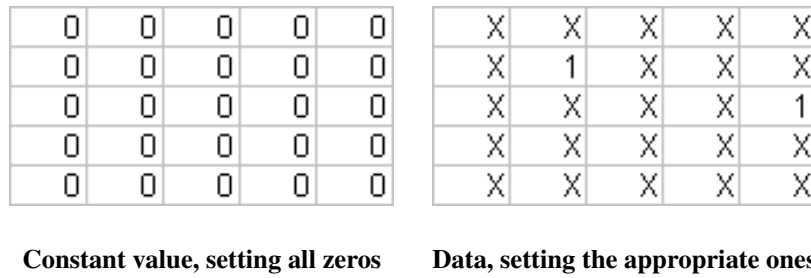
Figure 1: Generators for Setting Constant Values

Construct has two generators for creating constant data. The values created by these generators will be the same over repeated Construct runs.